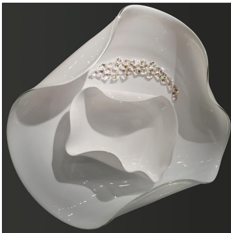
Celestial Ocean wall detail: 24" x 24"

Modell will also present new pieces from her 'Starburst Collection' of 4' x 6' framed art glass assemblage mirrors. She plays with depth and perception by adding textural objects, including blown and dichroic glass, with matte and gloss finishes, and Swarovski crystals. Ultra-luminous glass mimics Modell's vision of supernova bursts of light, creating vibrant star formations. Additionally new large galactic vessels will be shown, focusing on layered elements within the work.