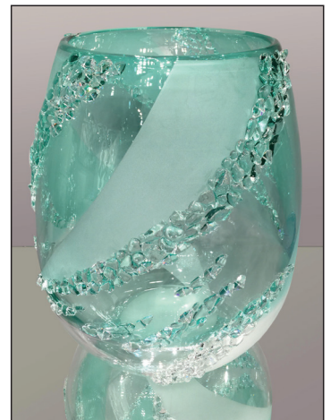
Polani 24"H x 16"W