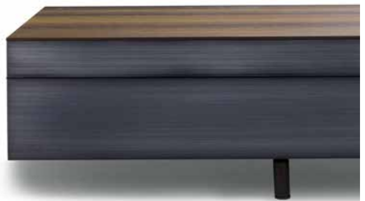
SC16 CONSOLE (2016)