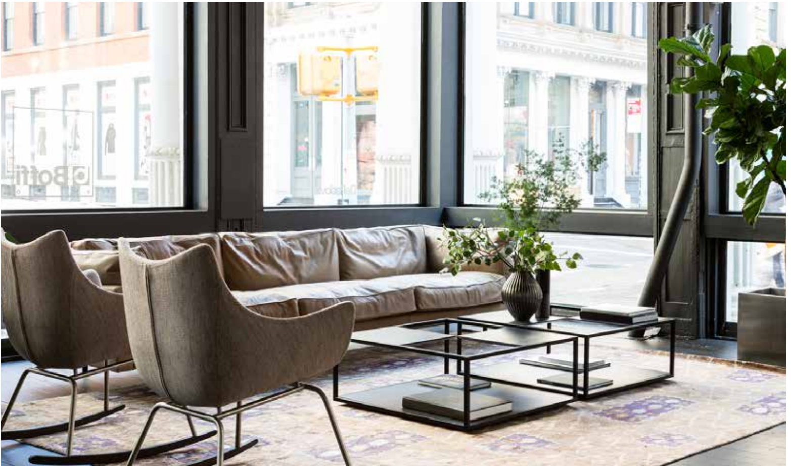
RUMI COLLECTION BY WOVEN CONCEPTS AND DePadova AT BOFFI SOHO

Architectural Digest Design Show, BOOTH 225, March 16-19th