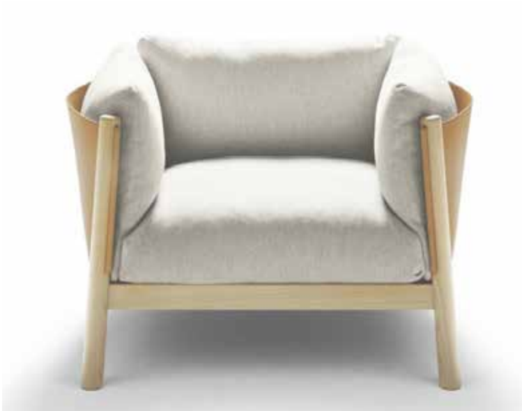
YAK ARMCHAIR, BY LUCIDI PEVERE (2015)

DePadova pioneered the introduction of Northern European design to Italy during the 1950's, drawing inspiration from the great European design classics. Acquired by Boffi in 2015, DePadova specializes in luxury, contemporary furniture design for private and contract projects. This is De Padova's first US design show, debuting their iconic Sen Tables and Yak Armchair at Woven Concepts Booth #225. Piero Lissoni takes the helm as the new creative director of DePadova, available at Boffi Soho.