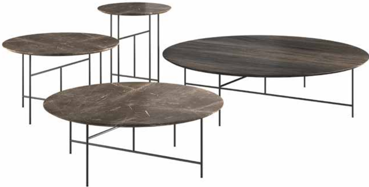
SEN TABLES, BY KANSAKU OSHIRO (2016)

DePadova pioneered the introduction of Northern European design to Italy during the 1950's, drawing inspiration from the great European design classics. Acquired by Boffi in 2015, DePadova specializes in luxury, contemporary furniture design for private and contract projects. This is De Padova's first US design show, debuting their iconic Sen Tables and Yak Armchair at Woven Concepts Booth #225. Piero Lissoni takes the helm as the new creative director of DePadova, available at Boffi Soho.