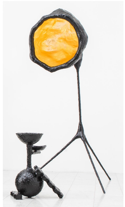
Yo! Burri Light No.1 (shown with Junk Band Series No. 2