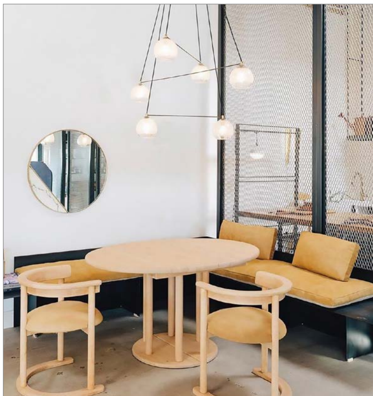
6 light clear bubble orb linea chandelier