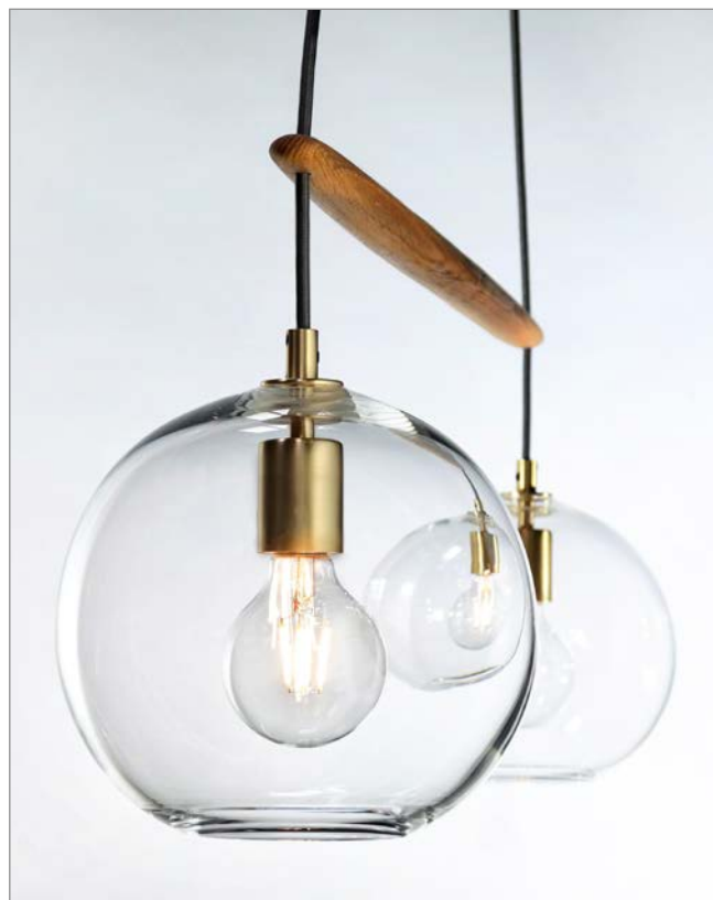
2 light clear orb linea chandelier with wooden crossbar